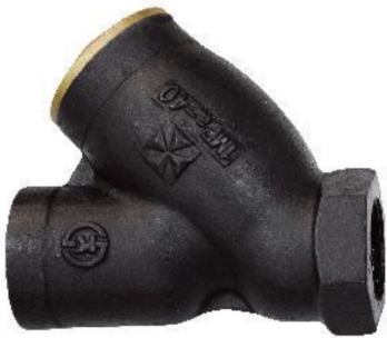
KS B 1538